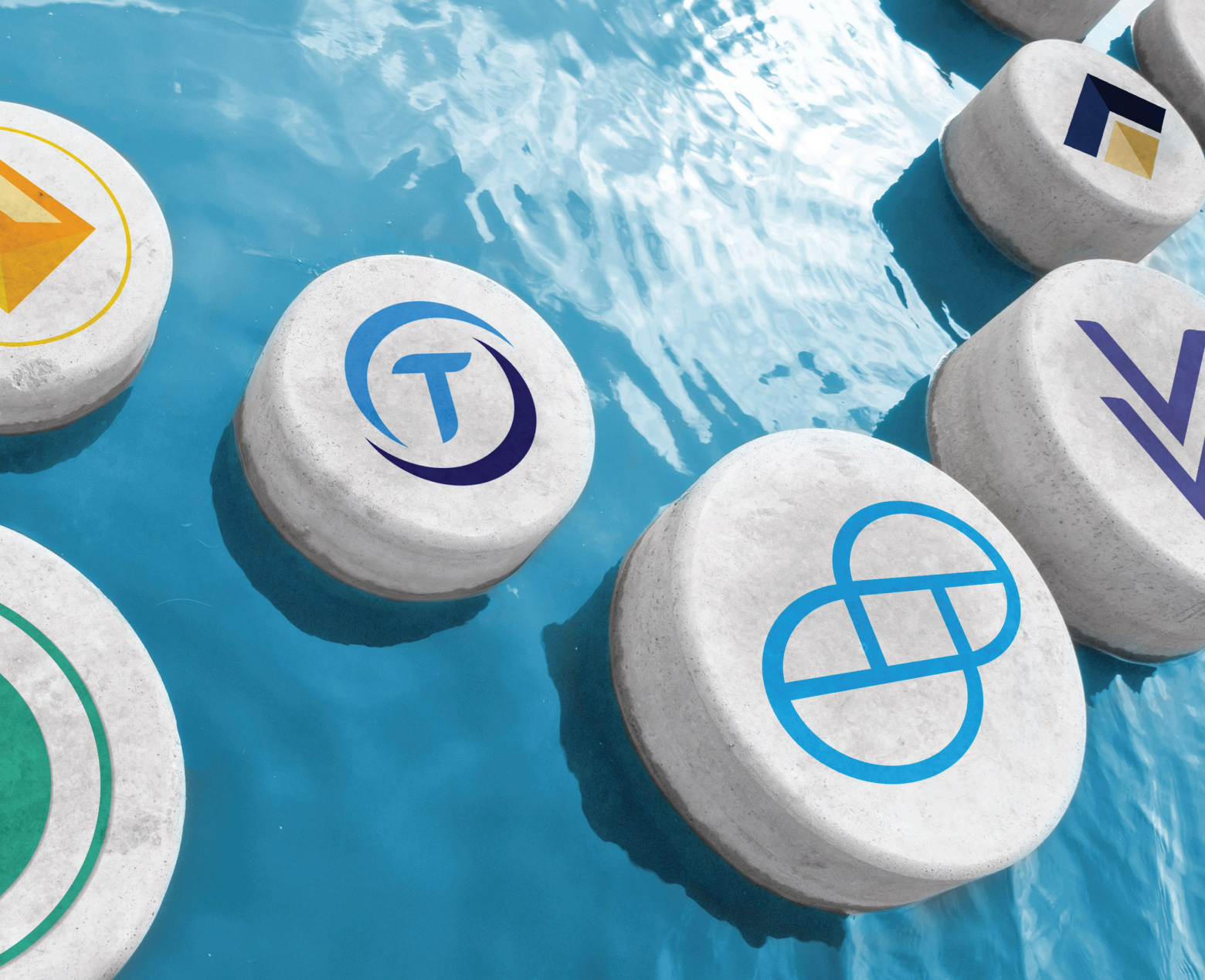
IMAGE COMPOSITION BY ANDREJ BORYS ASSOCIATES, USING PHOTO BY RUDMER ZWIERVER

importance: Volatility encourages users to hoard (if the value is going up) or avoid (if it is going down) the currency rather than use it. It makes lending risky, as currency movements can exceed interest payments. A lack of lending and credit inhibits the formation of mature financial markets. In response, a flood of proposals have been made for new cryptocurrency designs that purport to provide a stable exchange rate similar to (or exactly mirroring) a government-issued currency like the U.S. dollar. These designs are called stablecoins .