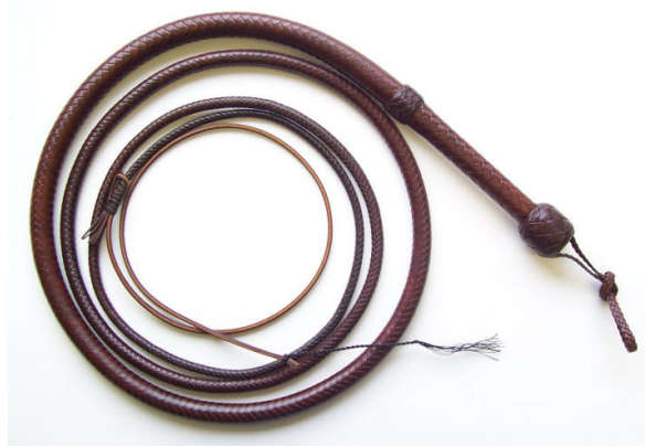
Figure 2: From http://www.northernwhipco.com/