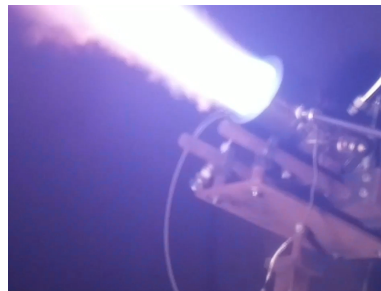
Engine testing at McGill University.