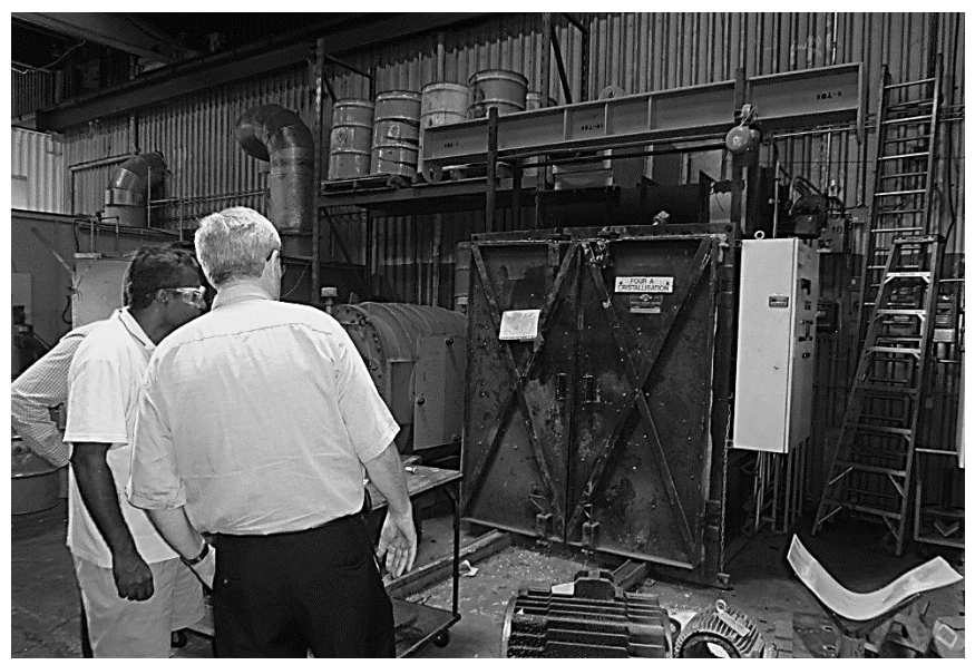
Technical visit to Moteurs Électriques Laval Ltée in Montréal region.